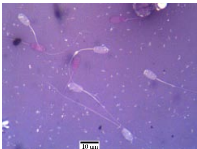
Figure 1. Evaluation of sperm vitality using eosin-nigrosin staining. Live sperm were unstained whereas dead sperm were stained red.

The percentage of live sperm (sperm vitality; Figure 1) was not significantly different between both groups although the N goats yielded a higher mean % of live sperm compared to the UC group. The percentage total sperm abnormality was significantly higher ( P < 0.0001 ) in the semen of UC goats compared to the N group. Sperm abnormalities observed included sperm with cytoplasmic droplets, looped tails, coiled tails and tailless heads (Table 2; Figure 2). The percentage of sperm with cytoplasmic droplets and looped tails were significantly higher in UC goats but there were no differences in the percentage of sperm with coiled tails and tailless head between both groups. Sperm concentration per mL was significantly reduced ( P = 0.0020 ) in UC goats compared to the N group. Similarly, total sperm count was also lower in the UC goats compared to the N group ( P = 0.0074 ). There was no significant difference in the sperm head length and sperm head width of the N goats compared to the UC group, respectively (Table 2; Figure 3).